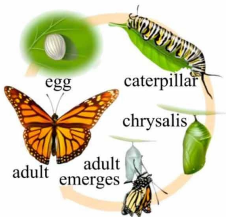
life circle of monarch butterfly